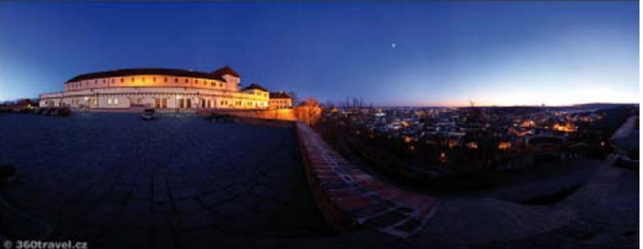
Gala Dinner at Špilberk Castle - starting at 19.00 hours.